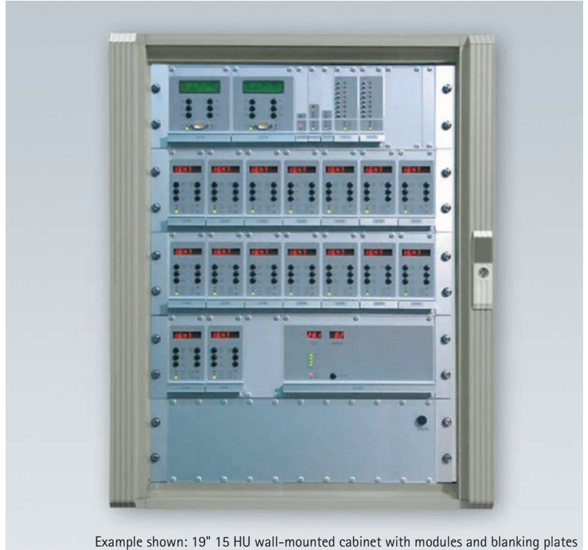
Example shown: 19" 15 HU wall-mounted cabinet with modules and blanking plates

Make your choice of desired component groups and modules on this and the following pages or call us – we will be pleased to offer you an equipment set that meets your specific demands!