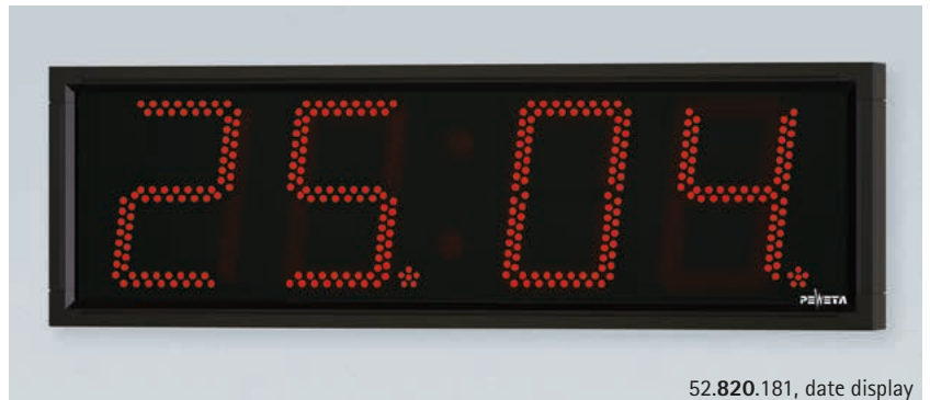
52.820.181, date display