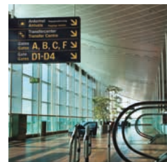
Indoor digital single-sided