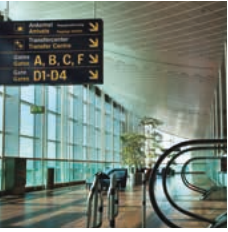
Indoor digital single-sided

as stand-alone units or combined into an integrated system