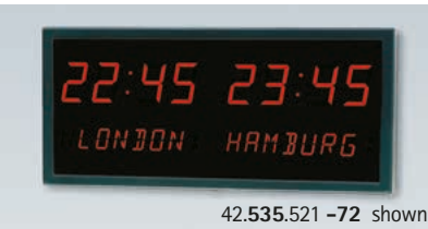
42.535.521 -72 shown

This provides you with a modern World Time Clock, that also meets all future requirements.