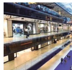
Indoor digital single-sided