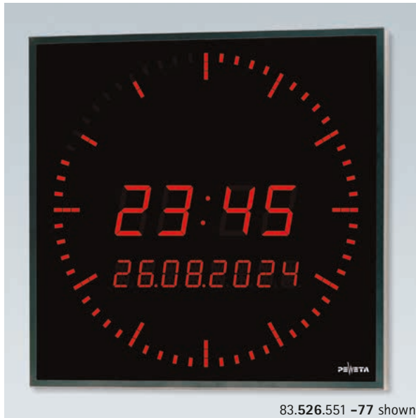
83.526.551 -77 shown