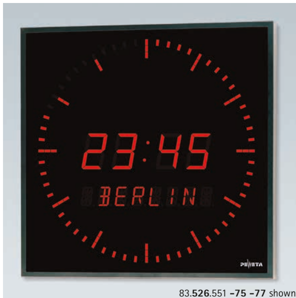
83.526.551 -75 -77 shown