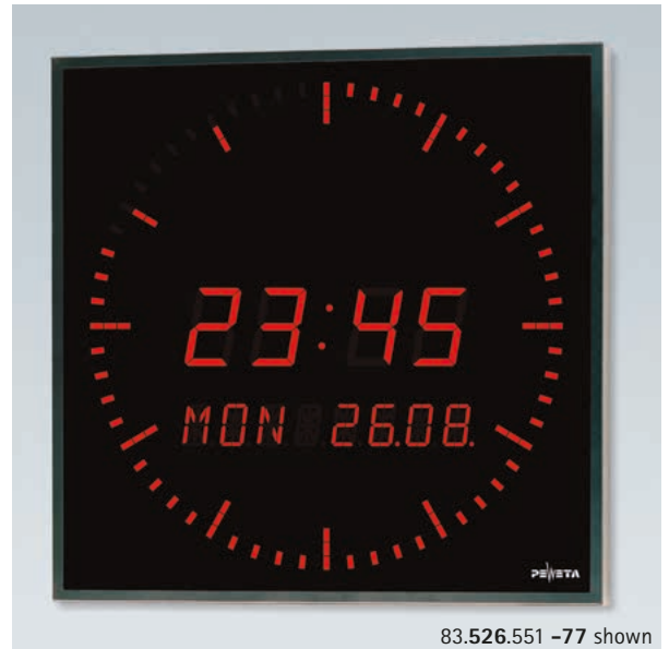
83.526.551 -77 shown