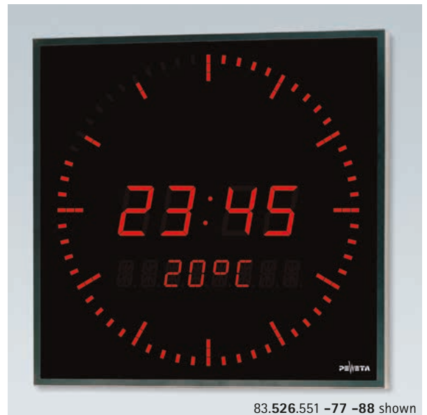
83.526.551 -77 -88 shown

This 400 x 400 mm wall clock as standard shows the digital time in hours and minutes and has a circumferential ring of red LED bar marks that show the seconds, counting up. An additional 8-character alphanumeric LED display line makes this clock a veritable "information centre". Depending on the features selected this clock is capable of providing all the information required for the assigned function – exact, professional, attractive, and outright reliable!