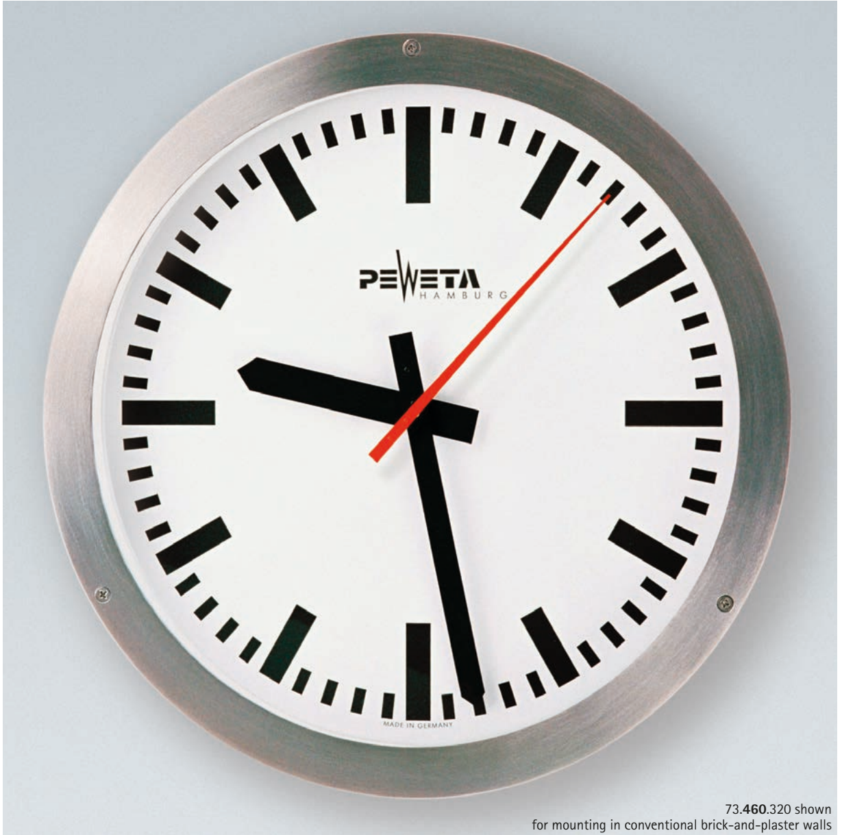
73.460.320 shown for mounting in conventional brick-and-plaster walls

These round analog clocks with stainless steel V4A cases were designed with the surgical operating room in mind. Mounted in-wall, flush with the surface, these reliable and accurate clocks meet all hygienic standards. Also suitable for all other demanding environments such as the pharmaceutical, beverage and food industries.