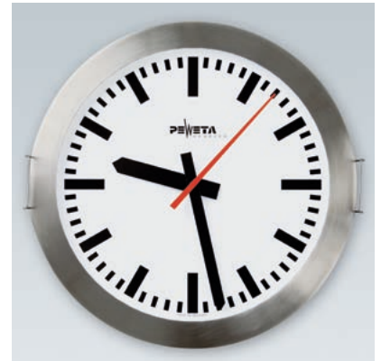
Clock 73.460.320 for in-wall mounting with spring-clip attachment device 01.460.301 for stud-and-panel wall mounting