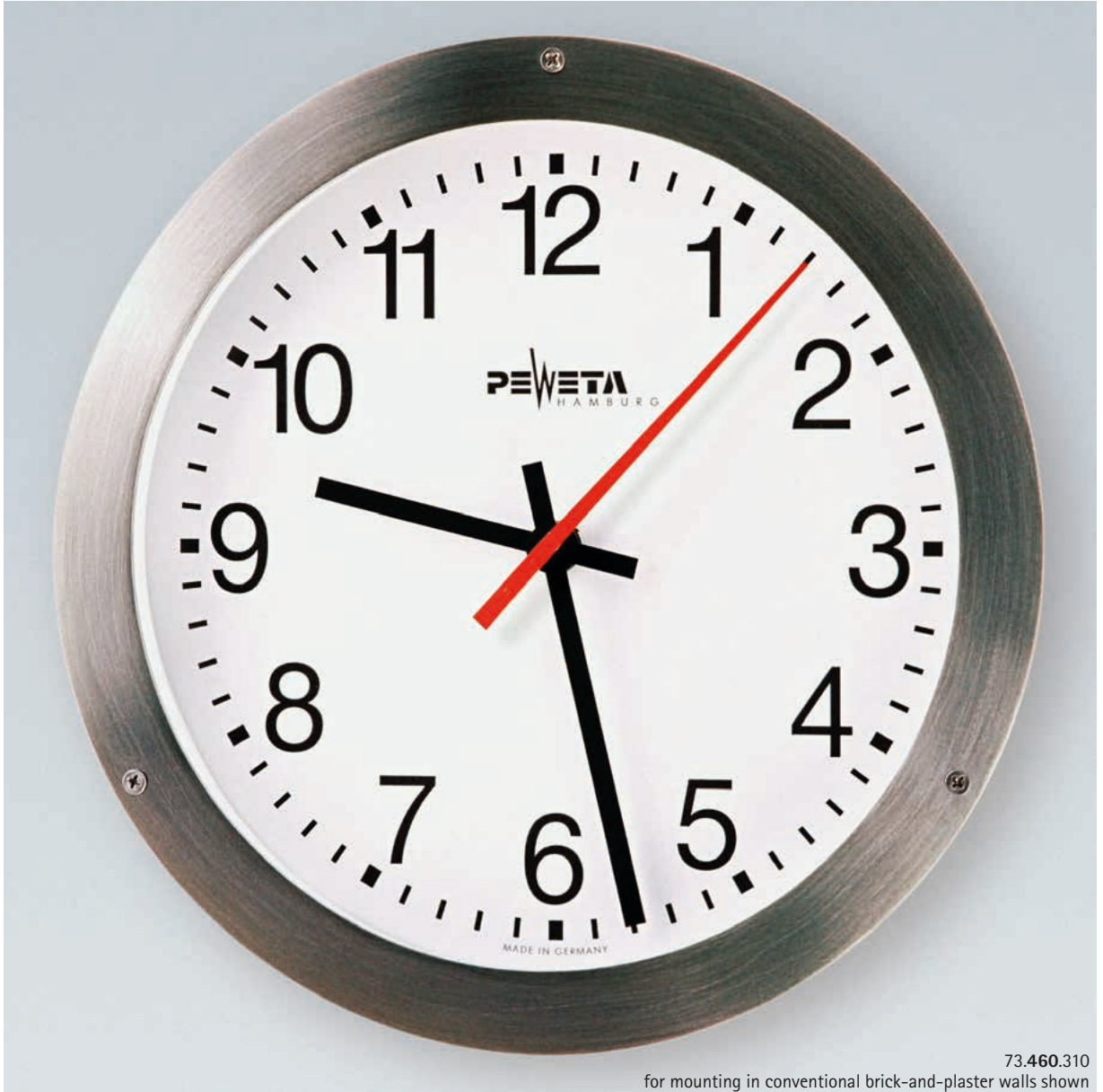
73.460.310 for mounting in conventional brick-and-plaster walls shown

These round analog clocks with stainless steel V4A cases were designed with the surgical operating room in mind. Mounted in-wall, flush with the surface, these reliable and accurate clocks meet all hygienic standards. Also suitable for all other demanding environments such as the pharmaceutical, beverage and food industries.