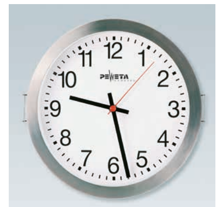
Clock 81.460.310 for in-wall mounting with spring-clip attachment device 01.460.301 for stud-and-panel wall mounting