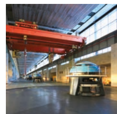
Large space analog double face

V4A quality stainless steel with an additional coat of protective varnish is outstandingly resistant to acids and other chlorous media and is therefore particularly suited for public swimming pools as well as for the chemical industry.