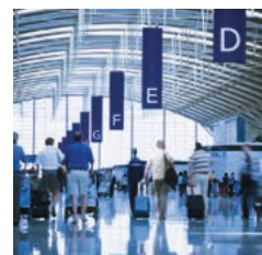
Indoor analog double-sided

No second hands on DCF77 and AirPort24 radio controlled clocks and on minute pulse 12...60 V controlled slave clocks.