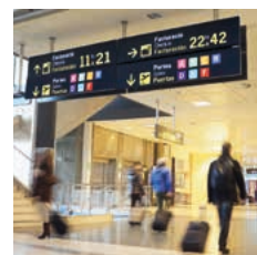
Indoor analog single face

No second hand on minute pulse 12...60 V controlled slave clocks.