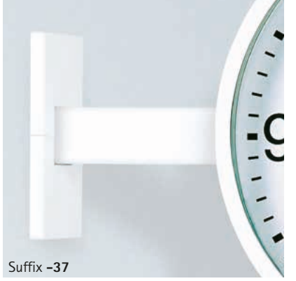
Metal cover for wall or ceiling mounting brackets available as an option

Double face clocks for all places where time must be readable from either side. Robust metal, fit everywhere!