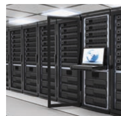
NTP function and advantages