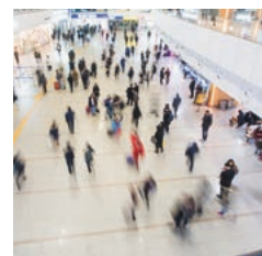
LED digital displays single-sided indoor

These clocks are available optionally with customised features at the surcharges as listed. Just pick your option(s) and add the appropriate suffix(es) to the Item No.