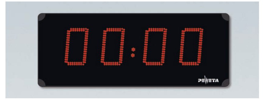
Examples show time, date, temperature (option), and stopwatch modes