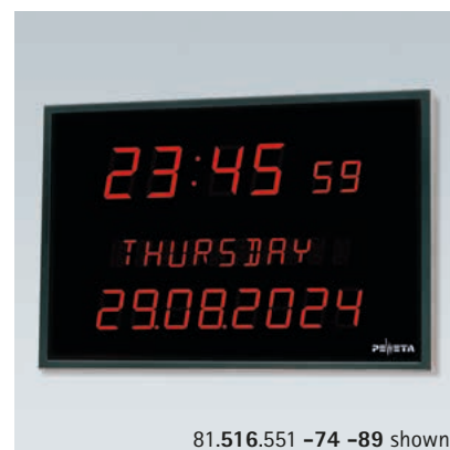
81.516.551 -74 -89 shown