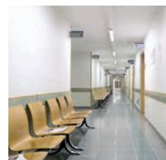
Indoor analog double face

Due to its components stainless steel V2A is an alloy almost completely impervious to detergents and disinfectants and is therefore excellently suited for the use in the food and pharmaceutical industries, in kitchens, laboratories and other clean rooms. And it looks good into the bargain, as well!