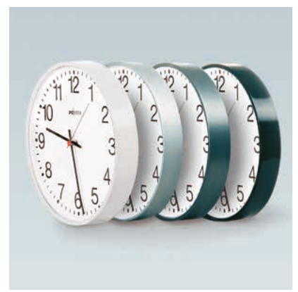
Optionally available with case enamelled in