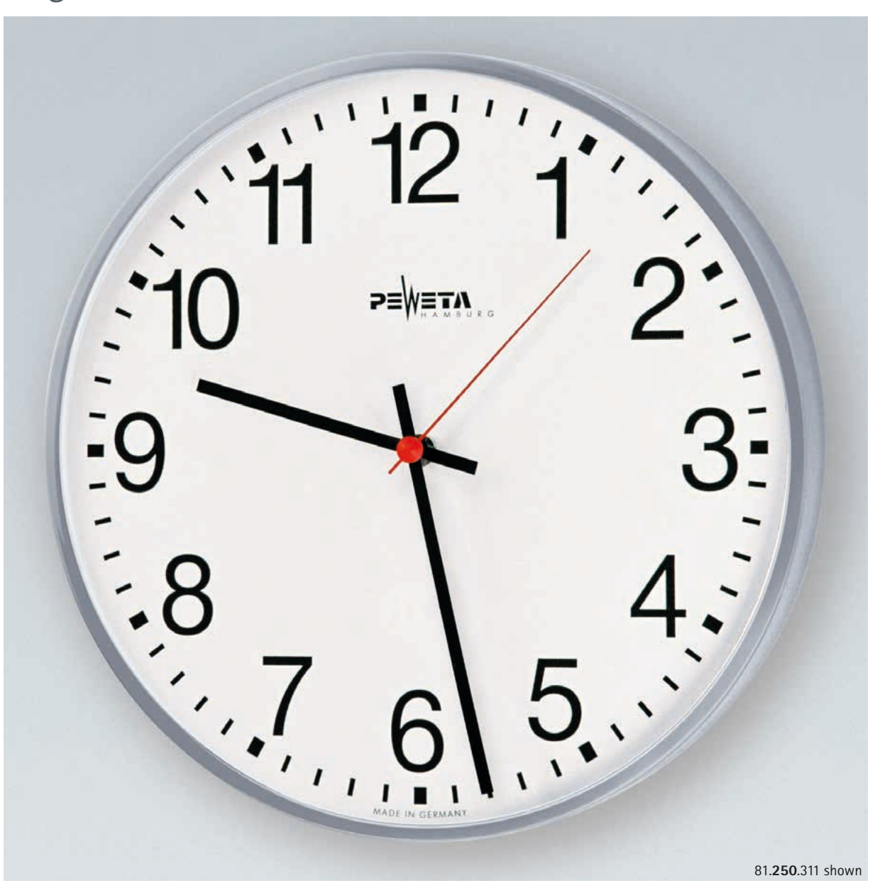
Highly presentable clocks for demanding environments a professional means of showing the time.